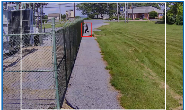
White border indicates thermal detection zone