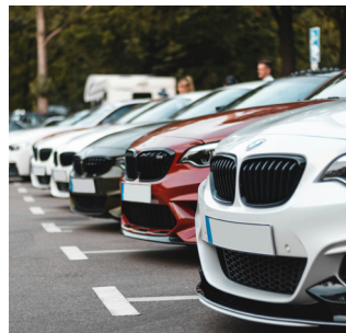
Vehicle Lots and Transportation

Our systems are built to detect people, not animals, trash, or trees.