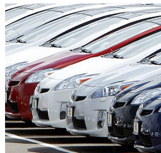
Vehicle Lots and Transportation

Our systems are built to detect people, not animals, trash, or trees.