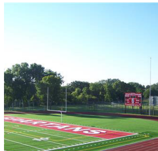
Schools & Sports Fields

Dual-video cameras use thermal to detect and color to quickly verify the event in progress.