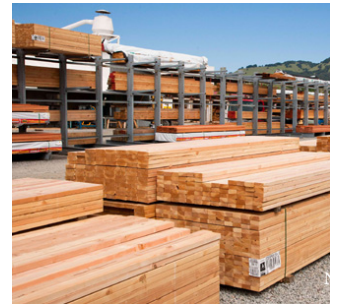
Lumber & Building Supplies