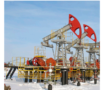
Mining, Oil & Gas