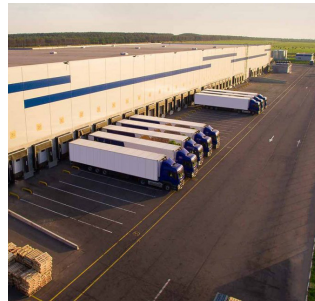
Transportation & Warehousing

Dual-video cameras use thermal and visible to detect and verify the event in progress.